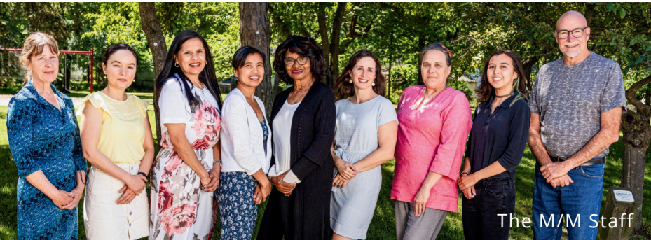
Mahany/Meininger Senior Community Center

Need help filing your taxes on time? The M/M Senior Center & AARP offer FREE tax preparation to all Royal Oak taxpayers using the 1040 form or EZEZ10K from January through April by appointment.