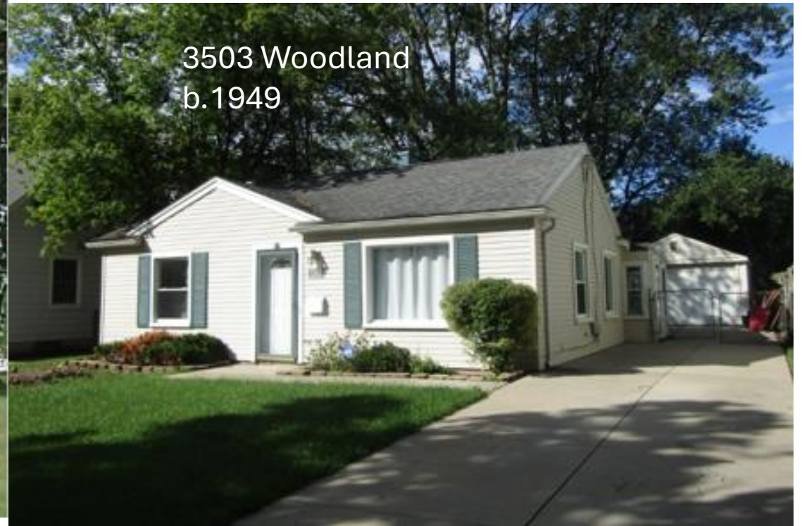
3503 Woodland b.1949