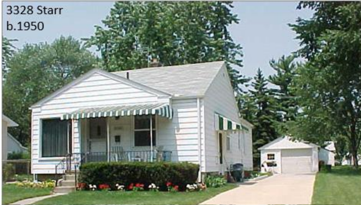
3328 Starr b.1950