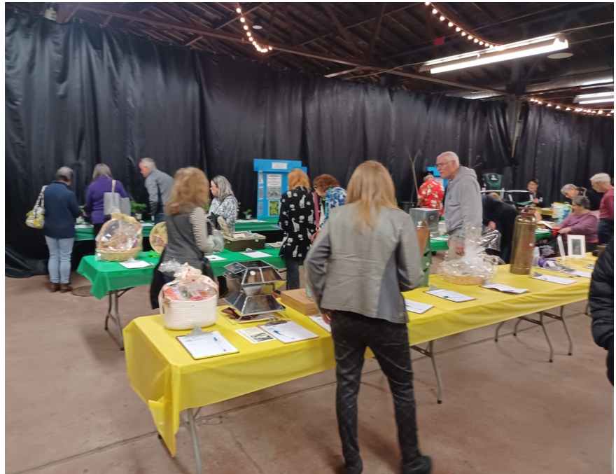
Fundraiser attendees checking out our silent auction items at the Farmers Market