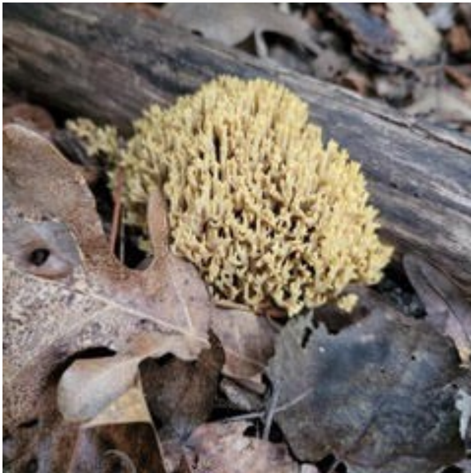
Crowned Tipped Coral.