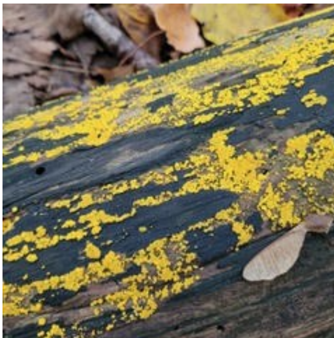
Lemon Drops Fungus

The walks will start up again in April in Tenhave Woods. Hopefully, the meetings will start up again in November, giving me time to find speakers. Information about the date and location will be forthcoming as we get closer to November.