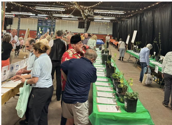
Attendees checking out this year's auction items