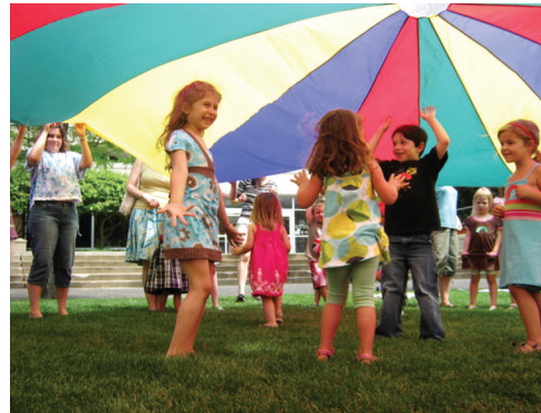
One of ROPL's many youth programs.