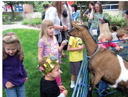
Opening Day of the 2011 Summer Reading Program.