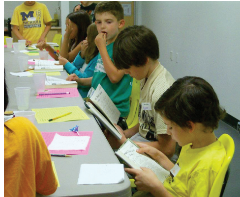
A meeting of ROPL's new Kids' Book Club.