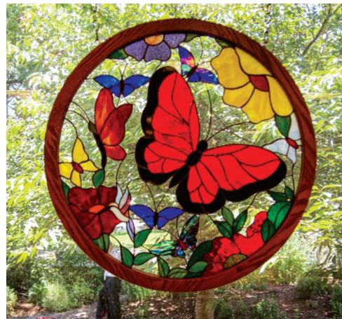
Original stained glass artwork. Photo by Rod Arroyo.