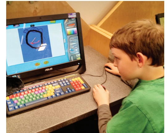
A young patron uses an AWE Early Literacy Station purchased through a grant from the Ronald McDonald House Charities.