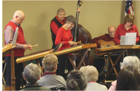
The Silver Strings Dulcimer Society performs at the ROPL as part of the Live Music Series.