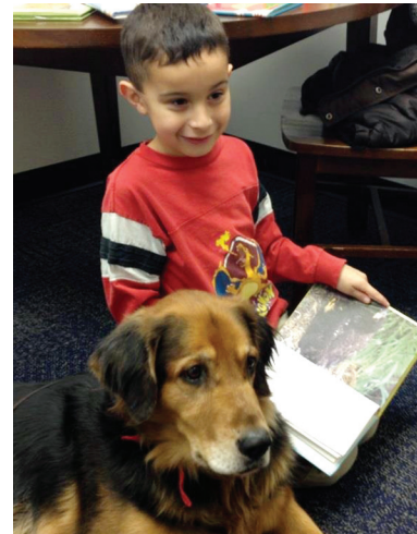
Read to the Dogs program.