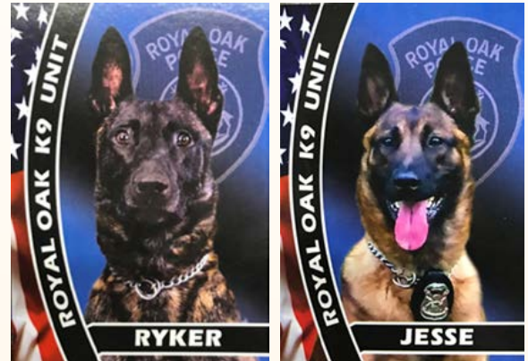
A limited number of K-9 Ryker and K-9 Jesse trading cards are available at the Royal Oak Police Station.

mistaken fireworks for gunshots and escaped out the door during Fourth of July celebrations. After weeks of intense searching, Johnnie is discovered dead near a wooded area. It is believed he was hit by a car.