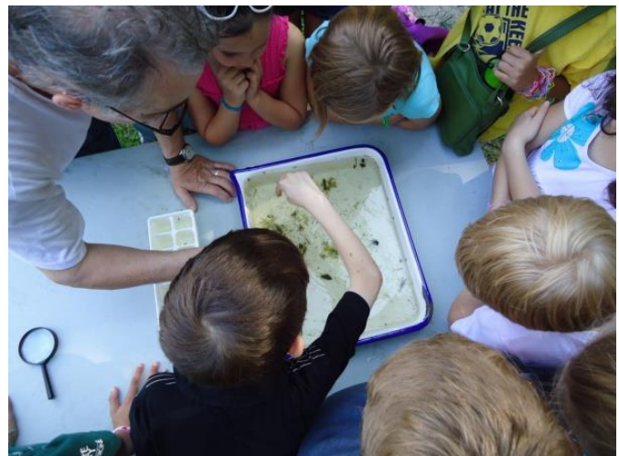
Pond Study Program