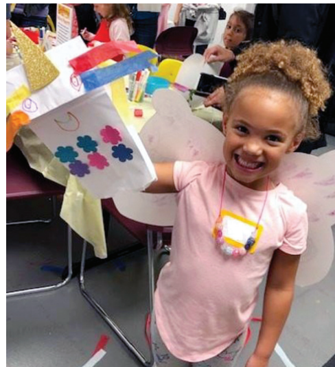
Young Participant at a Pinkalicious Party.