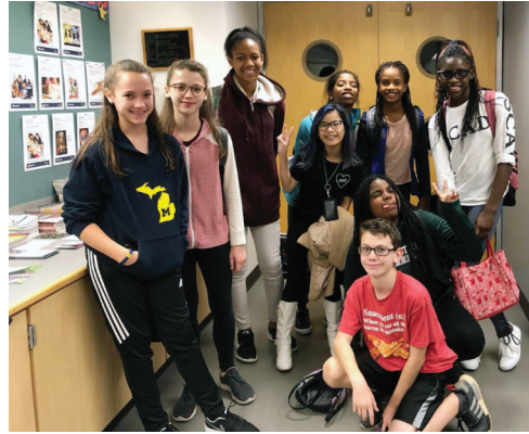
Teens waiting for Teen Café to begin.

*Door counter was not installed on the 11 Mile entrance for over a month. Old door counter also malfunctioned on a number of busy days on south entrance.