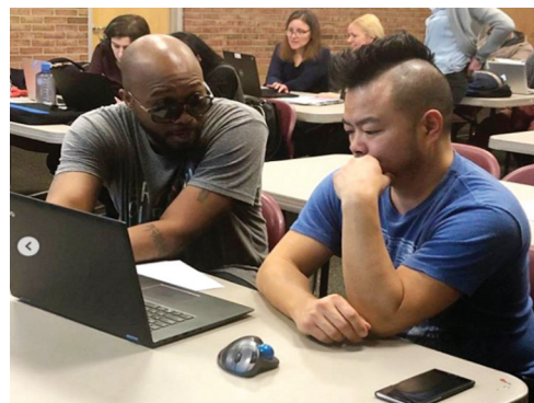
Participants helping each other during a coding class.