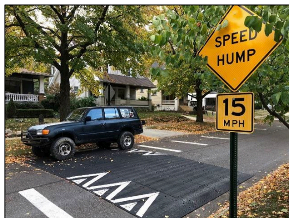
Example of removable speed hump (Example is 14-foot wide, Merrill humps will be 7-foot wide)