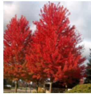
Autumn Blaze Maple

All plantings include mulch, arbor tie and tree stakes.